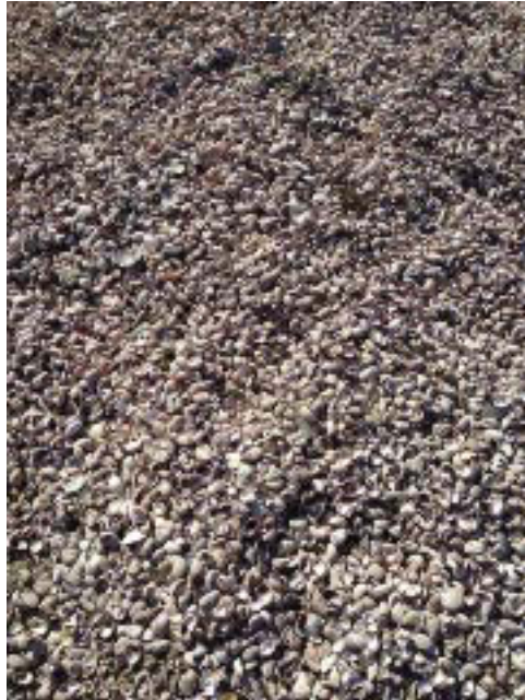
An abundance of seashells

people, animals, every living thing and living creature on your earth and on all other planets and in all other galaxies and in the multiverse, are all emanations of Source, meaning they all emanate from the Source of All That Is. Everything that is an emanation of Me, Source, is created in abundance. I rarely create one of anything. Just not in My nature. Well, you could say there is only One of Me, but even that is not true, because YOU are all Me, the plants are all Me, the creatures are all Me, the galaxies are all Me, and so on.